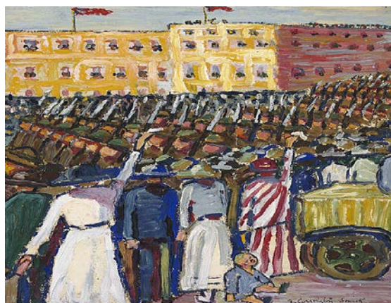
Grace Cossington Smith, Reinforcements: Troops Marching , c. 1917

The WOMEN'S HISTORY NETWORK Midlands Region: